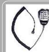
Keypad microphone SM07R1