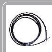
Cloning cable CP06