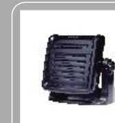
External speaker SM09S2