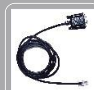
Programming cable PC21