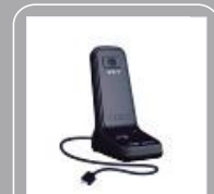
Desktop Microphone SM10R2