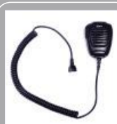
Palm microphone SM07R2